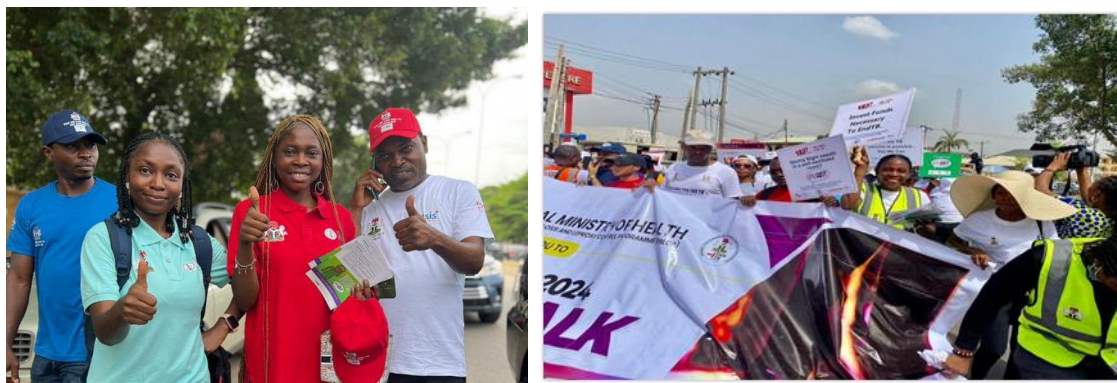
Fig 8: Pictures from TB awareness campaign.

Additionally, Lawyers under the TB Coalitions in Abuja and Lagos carried out human rights sensitisation and awareness at the community level during the Nation TB Testing Week and engaged with the National and Lagos State TB Programs on effective human rights-based TB response in their interventions. Lawyers' Alert engagement with the Media who are also members of the TB coalition has increased the awareness of the media to inform the general public on TB prevention and care. The media have also shown interest in stories around Lawyers Alert and other stakeholders' TB work and have reported the same as editorials and development issues as against the practice of reportage around events.