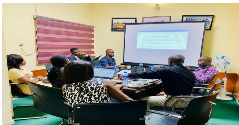
Fig 6: Lawyers Brainstorming on TB Strategic Impact Litigation.

Furthermore, trained lawyers brainstormed and carried out a Strategic Impact Litigation (SIL) to further expand the frontiers of PATB Rights and address issues of stigma and discrimination. The action was instituted at the Federal High Court, Abuja. The case in court seeks to change the narrative on right to health in Nigeria and discrimination on the basis of health status (TB Status) and also generate the demand for CRG TB approach through the court. Trained lawyers brainstormed to further expand the frontiers of PATB Rights and address issues of stigma and discrimination.