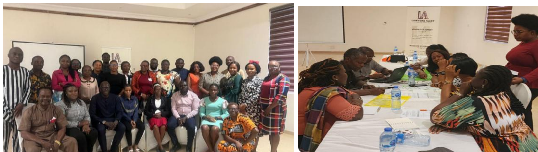
Fig 4: Akwa Ibom State Gender Equality Movement and the Benue State Gender Equality Movement.

Each state has successfully developed a comprehensive advocacy plan tailored to its unique context and challenges. These state-specific advocacy plans guides coordinated advocacy to address gender inequities and promote an inclusive, people-centered HIV, TB, and Malaria response. The developed advocacy plans support gender-responsive health access. It focuses on revising the HIV workplace policy, passage of TB Laws and strengthening TB, HIV, and Malaria services by addressing gender-related barriers.