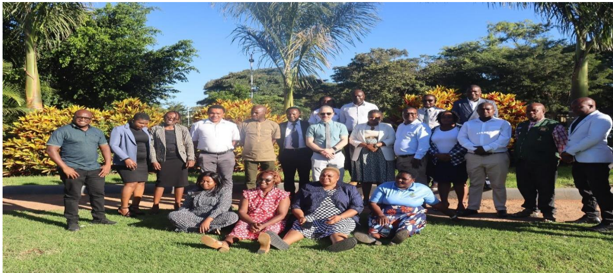
Fig. 14: Zimbabwe Policy Dialogues with MPs.

This intervention provided the first opportunity to engage with the judiciary on TB issues. Engaging these stakeholders has therefore heightened their knowledge of CRG TB response and the need for extensive law and policy reforms on TB, which address emerging rights violations and provide access to legal remedies.