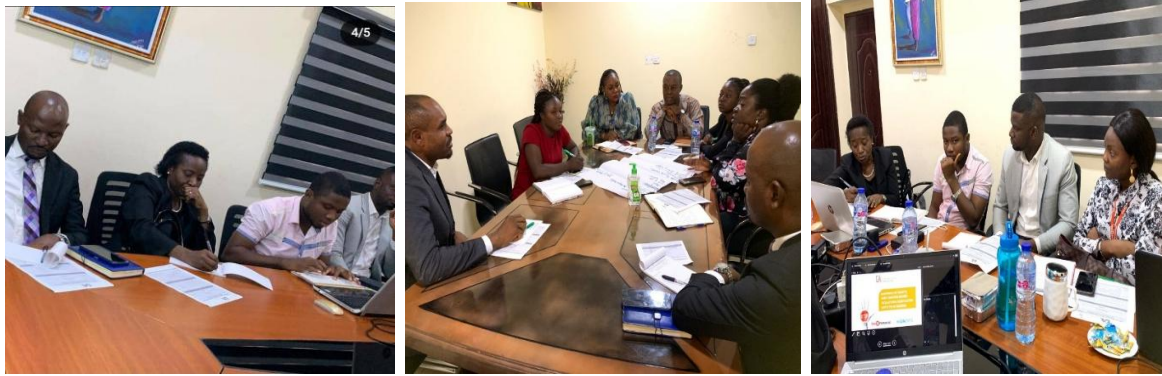
Fig 1: Participants noting their observations of the LadockT tool during the consultation meeting

Lawyers Alert LADOC-T was expanded to include rights-based violations associated with TB. Lawyers Alert trained affected communities and key stakeholders to share experiences of rights violations associated with PATBs, tailored towards evidence-based advocacy addressing remedial measures & the challenges encountered. The tool was disseminated to community members to document violations.