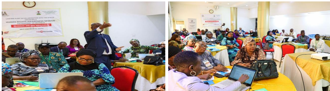
Fig 7: Training of NTBLCP Officials of HR TB response.

Lawyers Alert carried out a series of advocacy at the Federal and State Tuberculosis Control Program to further its interventions towards a TB right-based approach. In collaboration with the NTBLCP, we have built capacity building for Officials of the NTBLCP and health care workers on rights-based, people-centered TB response.