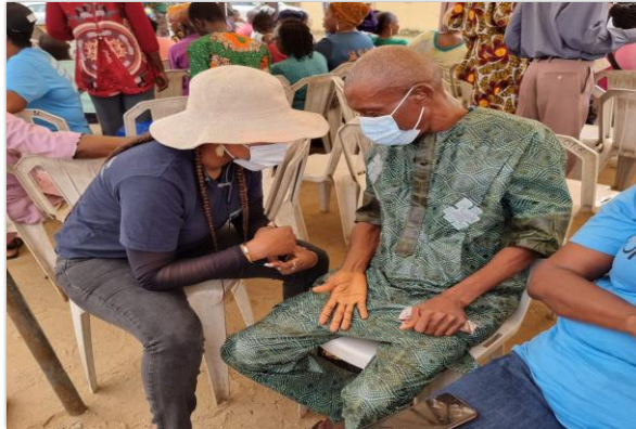
Fig 5: Beneficiary reporting right violations to a lawyer during an awareness campaign in Lagos state.

harassment of a PATB who was undergoing treatment, the authorities were involved regarding the harassment and she was given access to justice following intervention, highlighting the power of legal action in combating stigma.