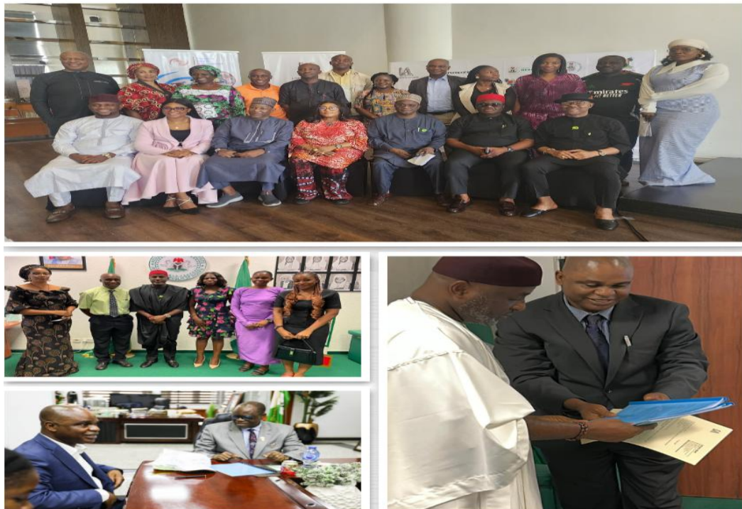
Fig 10: Photos of Lawyers' Engagement with the National Assembly

In line with the National Tuberculosis, Leprosy and Buruli Ulcer Control Programme Human Rights and Gender Action Plan for TB Care and Prevention in Nigeria 2021 – 2025 , which calls for the implementation of laws, policies, guidelines, and systems that facilitate an enabling legal environment to end TB laws and policies engaging lawmakers and policymakers. This includes engineering the process for the passage of a TB-specific law and policies promoting human rights and gender in the Nigerian disease response. The Nigerian National Assembly (Parliament) and some state houses of assembly are being engaged for this purpose. The capacity of MPs, particularly the Committee on HIV/AIDS, TB, and Malaria, was built on the importance of a legal framework that is both rights-based and aligned with international standards. Through a tailored two-day parliamentary retreat and training modules, MPs were engaged on the need for legislative reform that protects PATBs' rights while advancing national health goals. A core team of legal experts was assembled to lead the drafting process. This team worked in close consultation with key stakeholders, including TB-affected communities, to ensure the draft law reflected lived experiences, addressed gaps, and promoted accountability. A series of brainstorming sessions and community consultations informed the content of the initial draft TB law, which is before the National Assembly for passage.