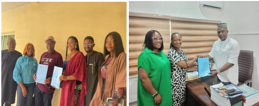
Fig 11: Presentation of Draft TB Bill to the Benue and Akwa Ibom State Legislators

Furthermore, Lawyers Alert engaged with State legislative bodies in Benue and Akwa Ibom State on laws and presentation of a draft Bill on TB at both States Houses of Assembly (TB Anti-Stigma Bill was drafted for each state and the network has since commenced advocacy to the State Houses of Assembly towards its passage).