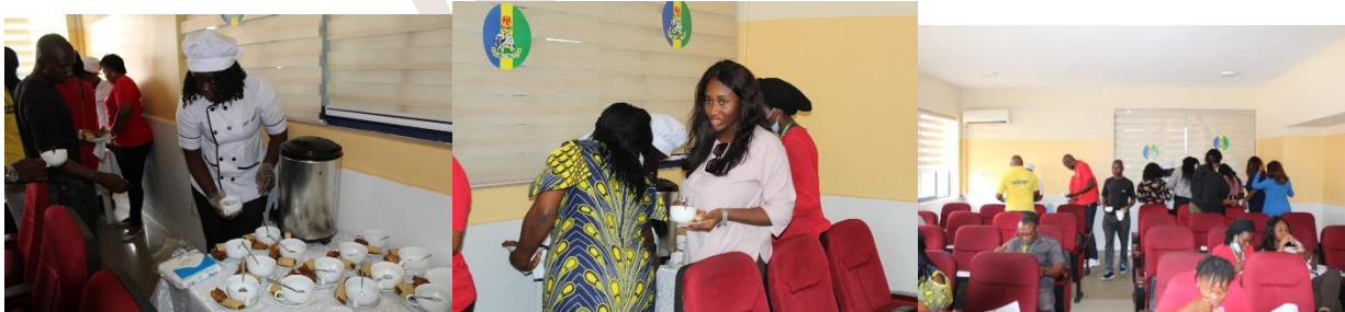
Fig 6: Cross-section of participants during tea.