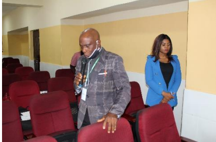
Fig 2: Opening prayer by participant.

The meeting began with an opening prayer by a volunteer. The Director Programs of Lawyers Alert welcomed all participants, gave a brief overview of why we are here and what the meeting seeks to achieve. All Participants present introduced themselves and gave their expectations.