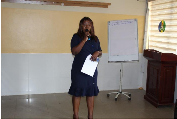
Fig 5: Director Programs giving the keynote remark.