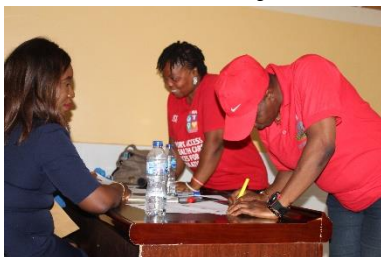
Fig1: Registration of participants.

All participants present at the meeting were duly registered. Representatives from the Police Duty Solicitor Scheme of the Legal Aid Council in the FCT, the Gender Unit of the Nigeria Police Force in the FCT, Women Rights Organizations and Staff of Lawyers Alert were in attendance.