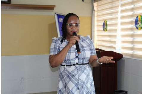
Fig 4: Representative of Legal Aid Council giving the goodwill message.

the Director General of the Council. A brief background of the the PDSS was given and explained the importance of a partnership with the GU towards providing services to survivors of violence. She concluded by saying that the PDSS is desirous of a better working relationship with the GU, Women groups and Lawyers Alert towards providing the necessary support to women suffering GBV. She welcomed everyone once again, appreciated the GU, Women groups and LA for this initiative and and encouraged all to make contributions towards achieving the meetings objectives.