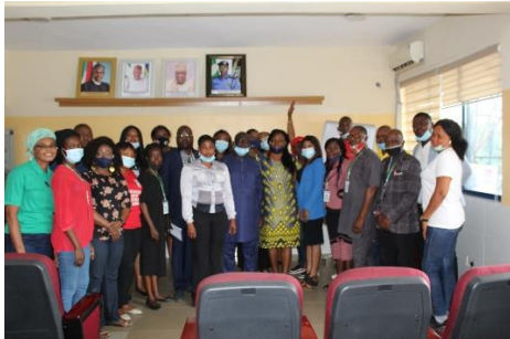
Fig 10: Group Photograph.

A group photograph was taken and participants proceeded to have lunch.