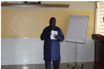
Fig 3: ACP Gender giving the welcome address and setting the agenda.

The Assistant Commissioner of Police in charge of the GU on behalf of the Deputy Inspector General of the Police Intelligent Unit and the Police Gender Coordinator gave the welcome remark. He thanked all participants for their availability. While setting the agenda, he explained to all participants the reason for the meeting and why we were gathered. The need to introduce the GU&PDSS to the women groups, create a link between women groups, GU&PDSS and also to collaborate and work together which cannot be overemphasized. He further explained that the meeting was principally to understand our areas of work, in terms of creating synergy between the GU, PDSS and women groups; discuss challenges we encounter and how best to provide services to survivors of violence especially women and girls. He urged all participants to actively participate in the meeting and wish us a fruitful deliberation towards a robust relationship with the Women groups, PDSS and LA.