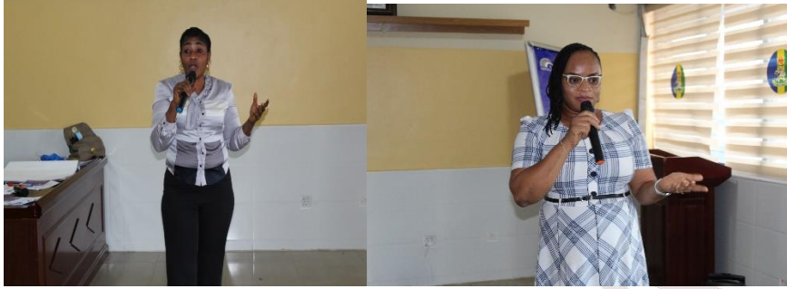
Fig 7: Representative of the GU and PDSS introducing the GU&PDSS to women groups